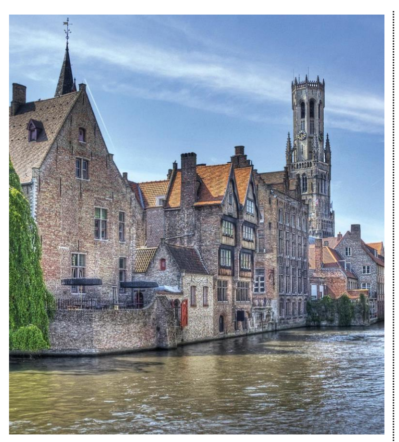
10 Days • 21 Meals: 8 Breakfasts, 6 Lunches, 7 Dinners

HIGHLIGHTS... 7-Night River Cruise, Amsterdam with Canal Cruise, Keukenhof Gardens, Arnhem, Middelburg, Belgium Waterways Scenic Sail, Bruges, Antwerp, Kinderdijk Windmills